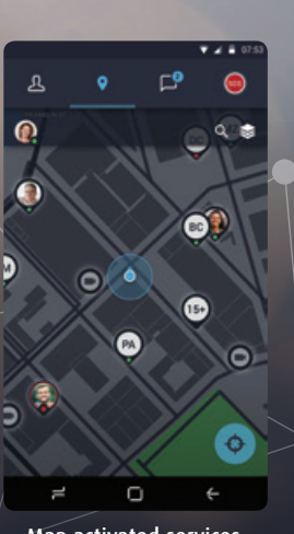
Map activated services