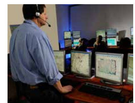
Forward Observer Simulator Facility