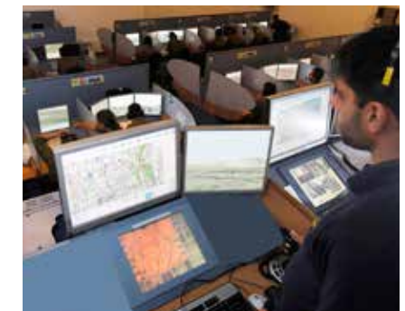
Tactical Simulator Facility