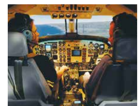
King Air B-200 Facility