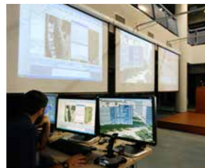
HLS Simulator Facility