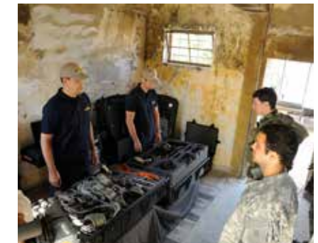
Land Live Training