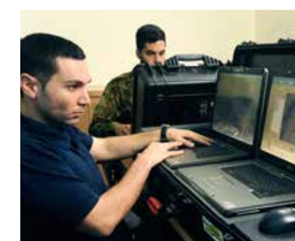
Trainer Portable Station