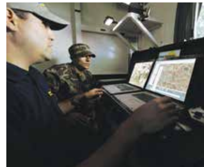
Live Training Instructor Station