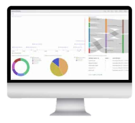
Investigation Dashboards - Malware Incident Investigation

SOC 3D is the only SOAR platform that records all raw SOC data and stores it on a big-data platform, for unprecedented visibility, investigation and hunting. It stores, correlates and indexes data from both security and non-security sources, including OT systems, so, analysts can get answers for any question in real-time, without depending on pre-configured logs. SOC 3D includes a rich catalogue of dashboards and the option to create your own, according to your needs during the incident response process..