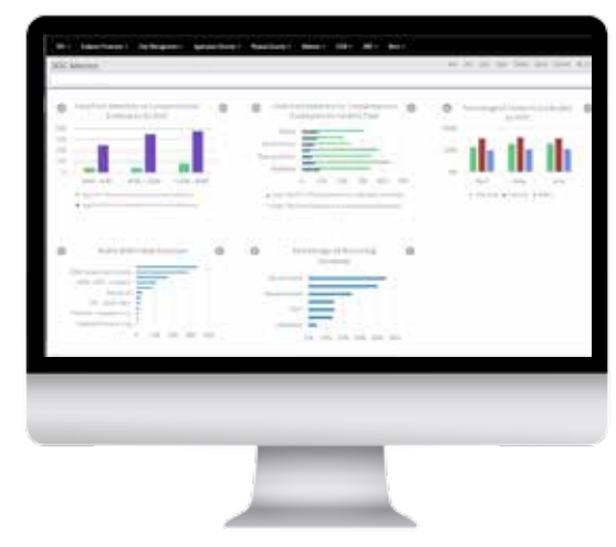
SOC 3D KPIs

SOC 3D automates manual tasks including incident prioritization, data collection, documentation and evidence gathering, internal and external reporting and more, to accelerate response and free analysts to recapture high-priority incidents. Processes typically taking hours can now be executed in minutes or seconds. SOC 3D provides you with full control over the tasks that will be automated.