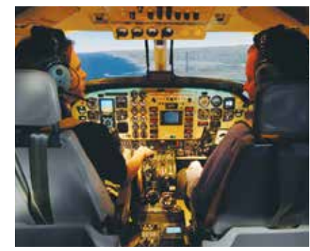
King Air B-200 Facility