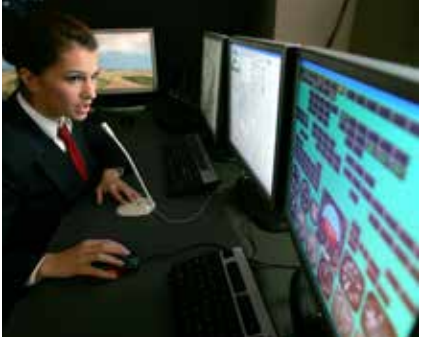
Mi-8/24 Instructor Station