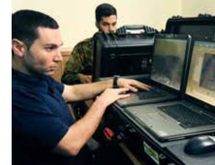
Trainer Portable Station