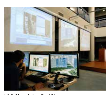
HLS Simulator Facility