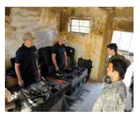
Land Live Trainin