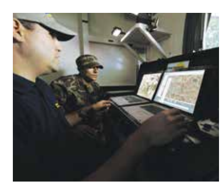
Live Training Instructor Station