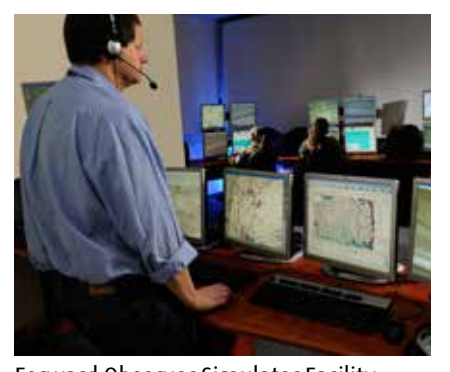
Forward Observer Simulator Facility